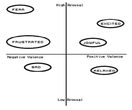
Figure 1: Affect Spaces and Emotions

In order to create an 'emotionally-aware' system the data from the four sensors was graphed according to the affect scale in common use per Russell [7]. The X-axis was labelled 'Valence' and its output was a combined product of the pressure and LDR sensor data and was used as an indicator of the occupants 'enjoyment' level. The Y-axis was labelled 'Arousal' and is a product of the GSR readings. The GSR is an indicator of skin conductance, measured across the hand, and increases linearly with a person's level of overall arousal [2]. This was used as an indicator of the chair occupants' intellectual engagement. This divides the graphing window into four distinct sectors or 'affect spaces', as may be seen below, with some common emotions indicated.