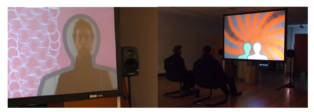
Figure 2. An image loaded inside a visitor's avatar (left) and two users with their avatars on screen (right).

As a visitor of AffeTech, you sit on one of the two empty chairs in front of the projection screen. The chair senses your presence and gives the instruction to turn the system ON. The brightness of the projection and the overall audio level increases. Also, an avatar fades in on screen, which displays an image sequence of you (figure 2). You place one hand on the electrodes attached to the chair and your avatar changes colour according to your cortical arousal level, as measured by the chair's sensor. If there is any sudden change in your signal (e.g. after taking a deep breath or being startled), your avatar makes a rapid movement accompanied by a breathing sound. If there is another participant in the other chair, both avatars are displayed on screen and the virtual distance between them varies according to the correlation of both signals (figure 2). In the case when the signals of both chairs are entrained, both avatars merge into a synchronous movement accompanied by a harmonic sound. The video and soundscape material reproduced are selected according to the average arousal level of both participants. Once you have finished experiencing the installation, the system goes back to the OFF mode automatically upon rising from the chairs.