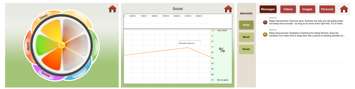
Figure 1. (a) Overview feedback wheel (b) Graph data for a person's self-reported quality of social interactions (c) Examples of educational advice messages for sleep

We visited participants in their home to install the application, provide a tutorial on it and to carry out pre-trial interviews. We informed participants that they would have a new set of questions to answer daily, but that they should answer the questions whenever they liked, as we were interested in real-world usage rather than forced daily usage. We asked participants to self-report honestly and highlighted that their responses were not being sent to anyone other than themselves. We also informed participants that the study period was 2 months, but that they would have the opportunity to continue with the trial, using the application, for an ongoing period if they chose. We called participants after the initial 2-month period to ask if they were interested in continuing with the trial and all but one (p60) continued. Reasons for this are explained in the Adherence subsection of the results.