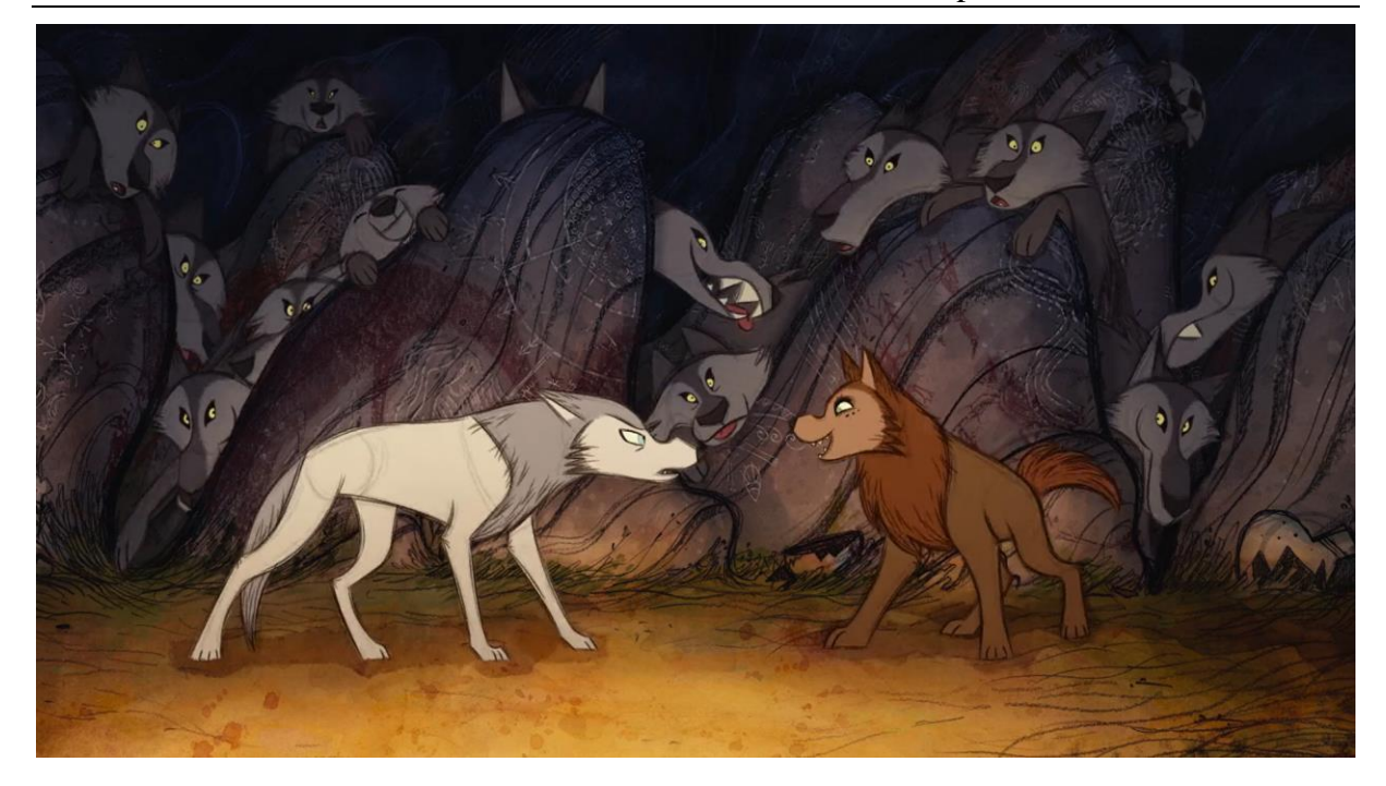
Figure 13 – Robyn takes wolf-form for the first time (00:47:47)