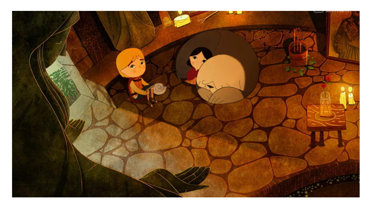
Figure 9 – Ben and Saoirse share a moment in the holy well (00:45:36)

The themes of adaptation and survival continue when the children venture out into the countryside, they eventually happen across a neglected, overgrown holy well (00:45:15), shown in Figure 9. Ben carries Saoirse with care through bushes of nettles, indicating the growing affection he has for his sister. Despite the well's decrepit appearance on the outside, the candles within are still lit, and it is here that Saoirse recalls a traditional treatment for Ben's sore legs; she plucks a bunch of dock leaves and rubs them on his stinging wounds. For such a simple scene, it is deeply significant. Depicting two young children practicing traditional medicine, huddled in a comforting religious setting, surrounded by the rural landscape, the film suggests that old Ireland will survive through to the next generation.