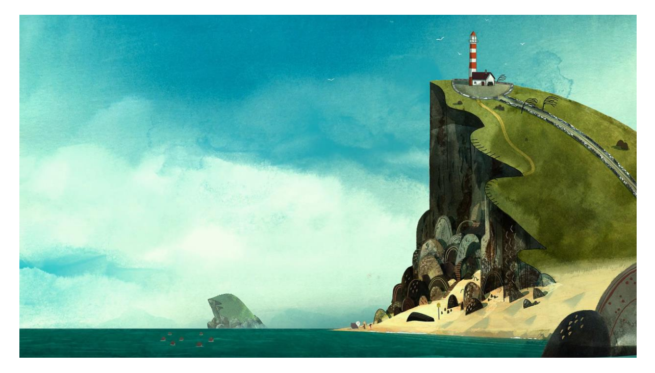
Figure 6 – Ben and Saoirse's island home (00:06:46)

ultimate symbol of escapism and isolation. Saoirse's bold choice not to go there is a heroic display, evidence of how much she has matured over the course of her journey.