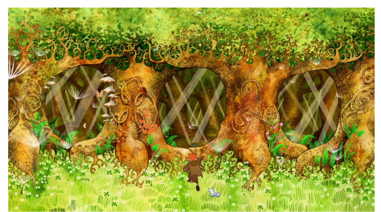
Figure 2 – Brendan explores the forest (00:26:27)

he returns to many times, exploring it with Aisling and developing his confidence. This playground of colour, the plants curling into spirals reminiscent of Celtic symbols of life, can be thought of as an external representation of Brendan's creativity, imagination, and youthfulness. Far from being a place of death as we are initially led to believe, it is a place of opportunity, of spiritual learning, of inner and external exploration, and a world in which the creative, rebellious Other is actively embraced and celebrated. This is a stark separation from the drab, dark walls of Kells, an isolated abbey that represents everything pulling Brendan down. Below, note the stark visual differences between the forest and the abbey, one vibrant with lush greens, yellows, and reds, the other monotone with sharp pale light and dark blues. The forest's sprawling roots and branches intermingle smoothly to create intricate patterns, implying that these symbols are inherent to nature itself. In the dark tower, crude and jagged signs are etched into the walls; the harmony of the forest is absent here, instead symbols jostle for space on the crowded walls, violently stabbing into each other.