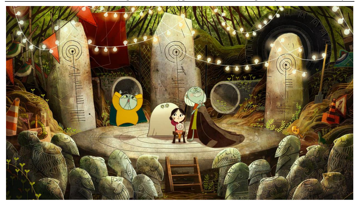
Figure 4 – Inside na Daoine Sídhe's mound (00:32:38)