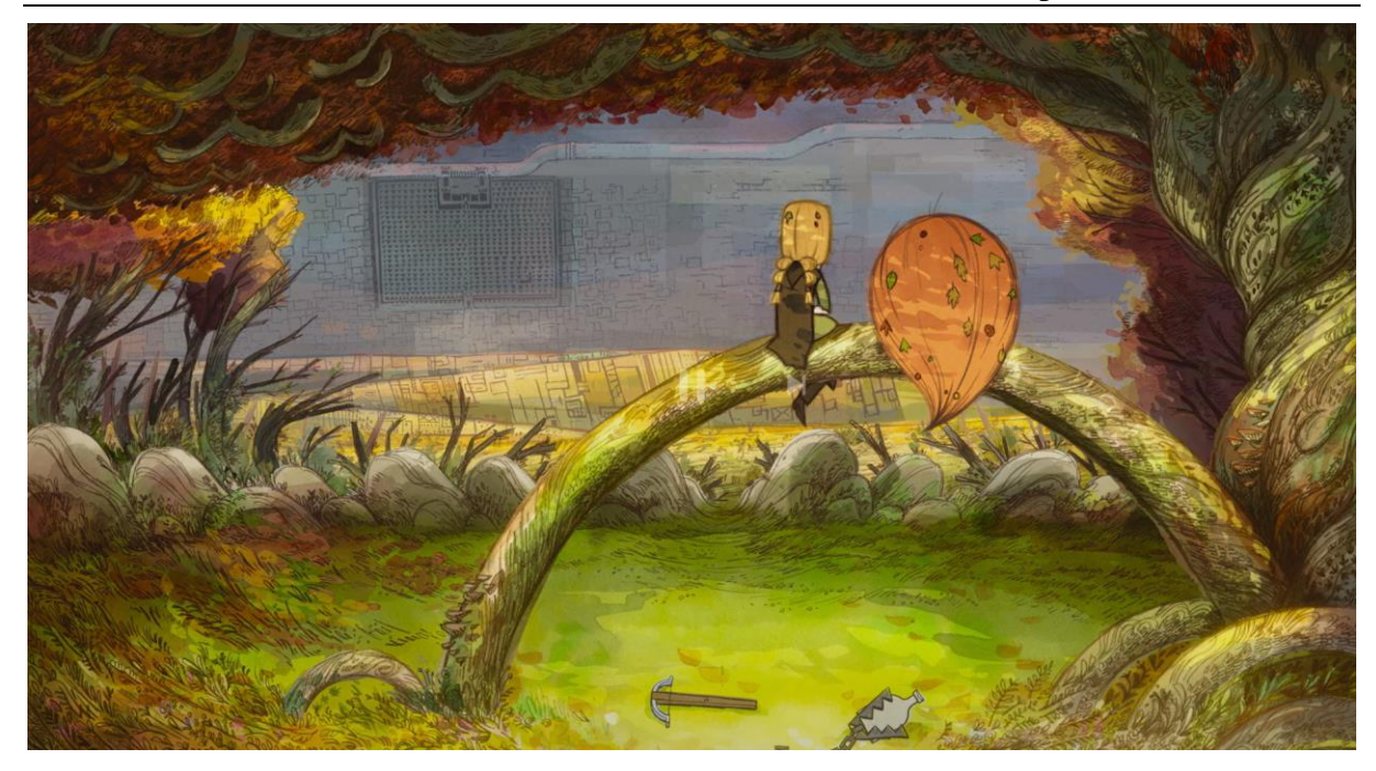
Figure 10 – Robyn and Mebh in the forest (00:34:20)

The trilogy's strong emphasis on external isolation is understandable given the nature of the medium, internal isolation is far more difficult to portray. However, in an era when most of the population of Ireland live in large towns and cities, physical separation is difficult to achieve. In busy urban landscapes punctuated with sound pollution, rising populations, and long working hours, the necessary time and resources required to seek out solitude in nature are not abundant. The implication that solitude demands long, intense periods of external seclusion is not a message that modern Irish people can garner practical utility from. Modern circumstances demand an alteration to the ways we depict solitude and nature on screen. It is possible to incorporate older ideas, according to writers like Ó Súilleabháin (1981), and in fact necessary; he argues that "reworking" old ideas and traditions is a central element of creativity because circumstances are always changing. Ó Suilleabháin writes about reworking in the context of musical traditions and language, but the process of reworking applies as much to the films of Cartoon Saloon, a trilogy inspired by the folktales of centuries past. Titon similarly examines "adaptive management" (2015, p.179), the process of consciously altering artistic traditions to ensure their resilience and continued relevance. This process is often experimental, but it is vital if old traditions and teachings are to survive cultural and