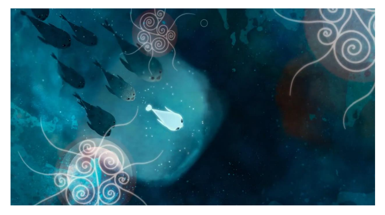
Figure 11 – Saoirse transforms into a seal (00:17:40)

tranquil state of mind. Separated from the worries of the rest of the world, and drifting through the sea without a care, this is a safe place for her to explore herself and her powers.